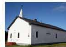
St. Philomena's Chapel