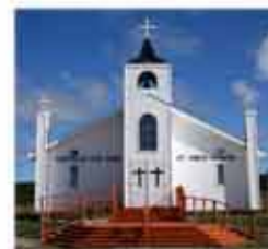
Chapelle Ste. Anne St. Ann's Chapel