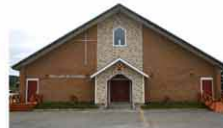
Our Lady of Lourdes Parish Church