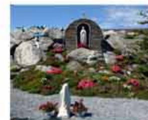
Our Lady of Lourdes Grotto